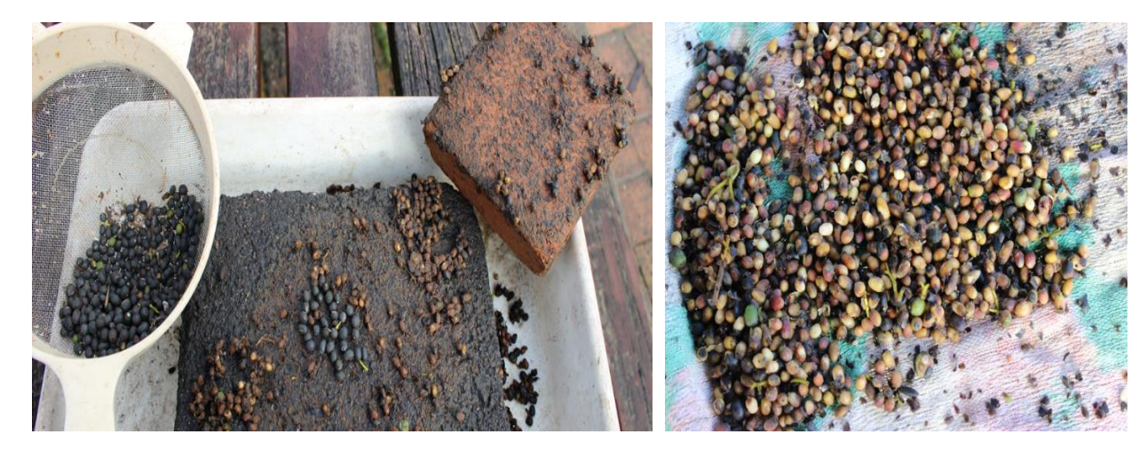
Figure 9. Seed cleaning of the native Pennantia corymbose .

<u>What plants</u>? Most New Zealand native species, exotic trees, and many perennial species and bulbs (Figure 9).