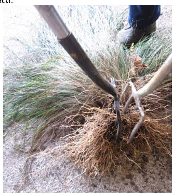
Figure 7. Division of Lomandra.

What plants? Carex, Iris, ferns, daisies, Ajuga, Hosta, Clivia and so much more in the perennial lines.