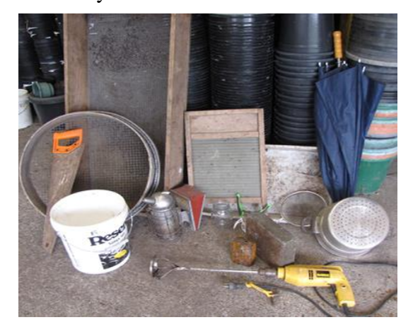
Figure 1. Tools of the trade.

Over the years I have seen many methods of propagation from the high tech to the simplest low tech you could have and interestingly enough some of the least thought-out have been the best methods that have the best results; maybe not the most productive but certainly some of the best return for money spent (Figure 1). The following are some of the methods used by our nursery and what we achieve.