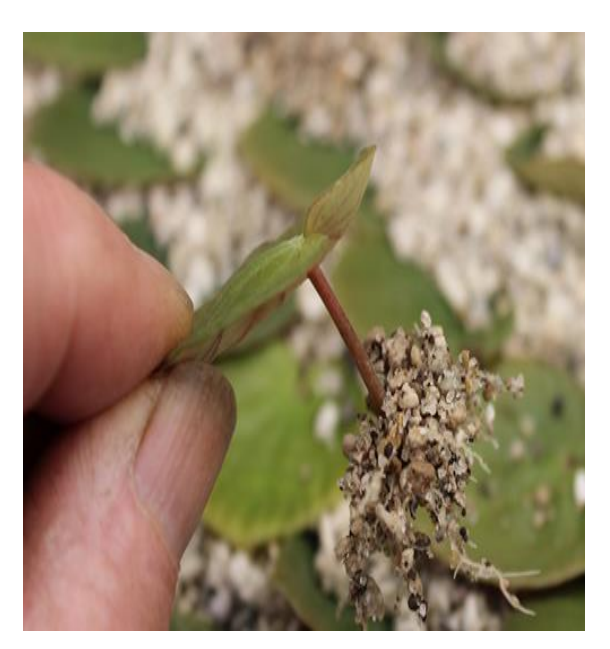
Figure 3. Leaf cuttings of Peperomia .

What plants? Begonia, Peperomia, Eucomis, and Haemanthus.