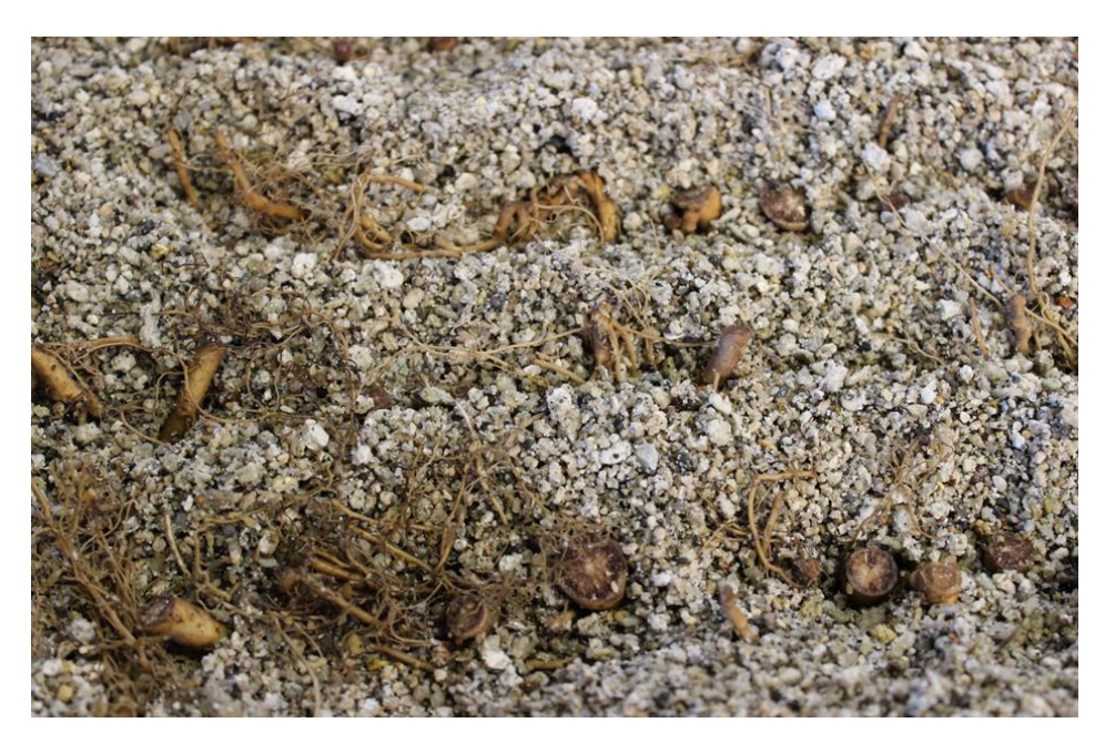
Figure 5. Root cuttings of Stokesia laevis.