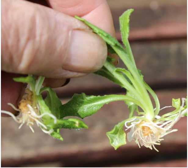
Figure 6. Tissue culture plantlets of Lobelia aberdarica .