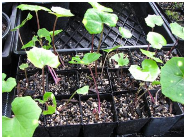
Figure 4. Rhizome cuttings of Farfugium japonicum 'Aureomaculatum'.