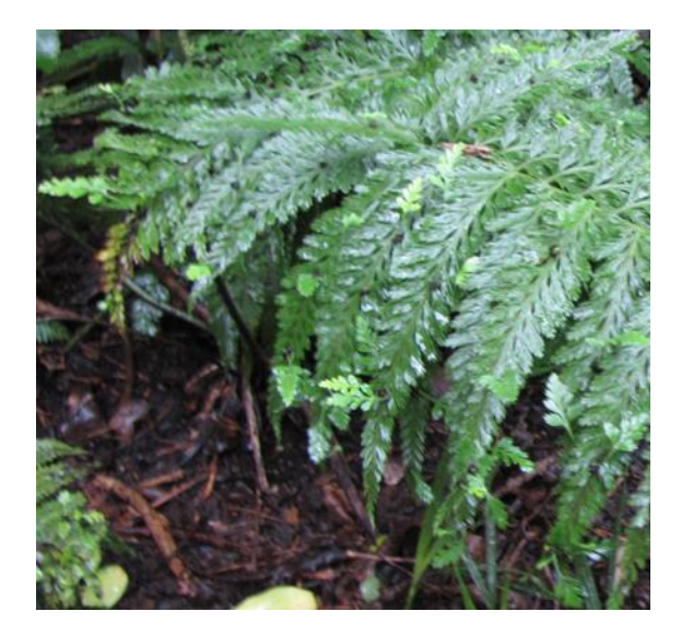
Figure 8. Pups on a leaf of Asplenium bulbiferum .

<u>What plants</u> - pups? Asplenium bulbiferum , Neomarica , and Ajuga .